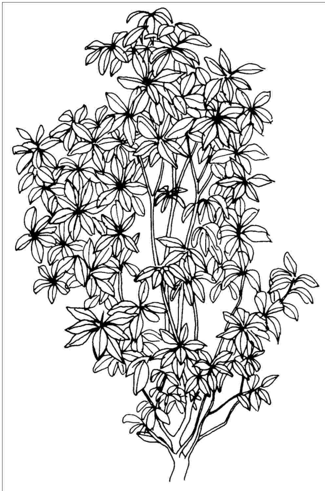
Figure 1. Middle-aged Magnolia grandiflora 'Bracken's Brown Beauty': 'Bracken's Brown Beauty' Southern Magnolia