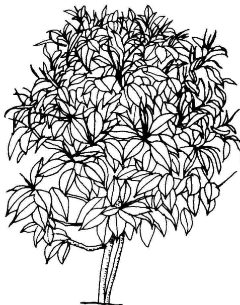
Figure 1. Young Magnolia kobus 'Wada's Memory': 'Wada's Memory' Kobus Magnolia

USDA hardiness zones: 5A through 8A (Fig. 2)