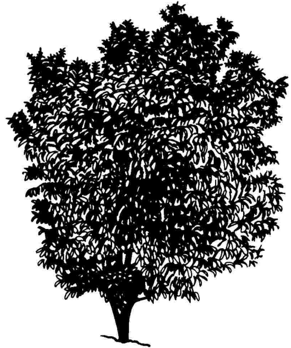
Figure 1. Middle-aged Malus x 'Harvest Gold': 'Harvest Gold' Crabapple