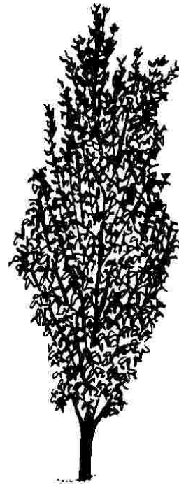
Figure 1. Middle-aged Malus baccata 'Columnaris': Columnar Siberian Crabapple