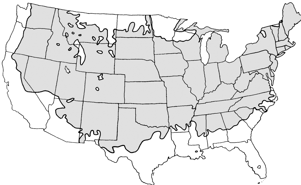
Figure 2. Range