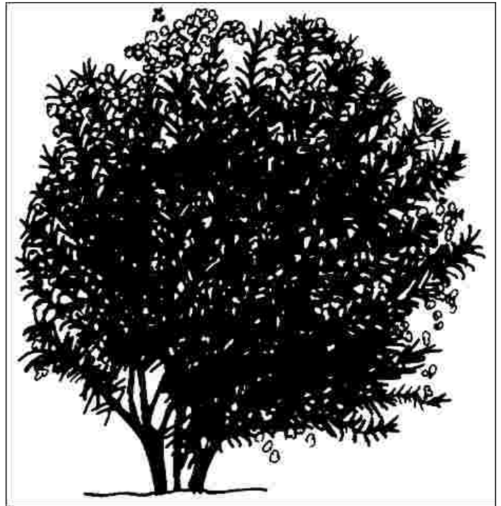
Figure 1. Middle-aged Nerium oleander 'Hawaii': 'Hawaii' Oleander

Uses: reclamation; urban tolerant; screen; specimen; trained as a standard; container or planter; hedge; deck or patio; parking lot island < 100 sq ft; parking lot island 100-200 sq ft; parking lot island > 200 sq ft; tree lawn 3-4 feet wide; tree