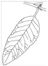
Figure 3. Foliage

Leaf arrangement: alternate (Fig. 3) Leaf type: simple Leaf margin: serrate Leaf shape: ovate, elliptic (oval), obovate Leaf venation: pinnate, brachidodrome Leaf type and persistence: deciduous Leaf blade length: less than 2 inches, 2 to 4 inches Leaf color: purple/red Fall color: purple Fall characteristic: showy