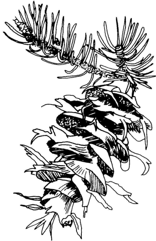
Figure 3. Foliage

Douglas-Fir is most commonly used as a screen or occasionally a specimen in the landscape. Not suited for a small residential landscape, it is often a fixture in a commercial setting. Allow room for the spread of the tree since the tree looks terrible with lower limbs removed. It is grown and shipped as a Christmas tree in many parts of the country.