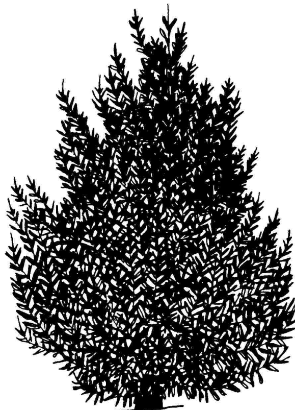
Figure 1. Young Pseudotsuga menziesii : Douglas-Fir

Availability: not native to North America