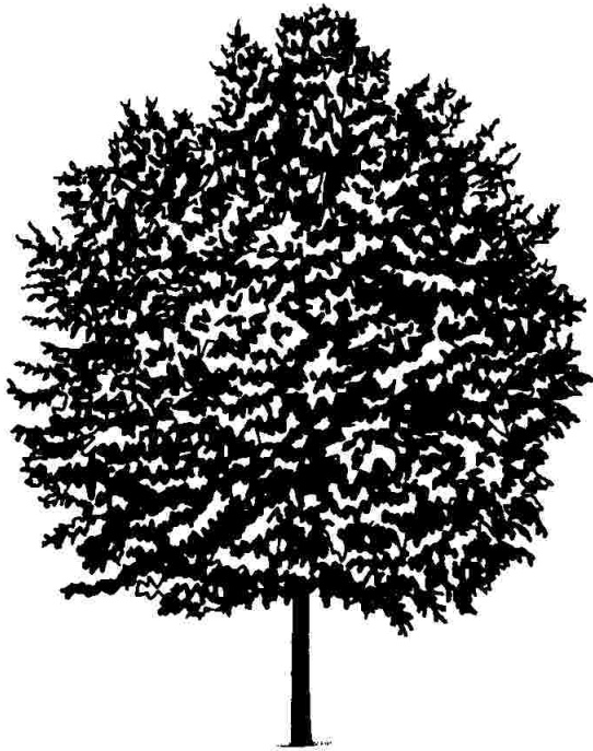
Figure 1. Middle-aged Quercus nuttallii : Nuttall Oak

This native North American deciduous tree is capable of reaching 100 to 120 feet in height but is more often seen at 60 to 80 feet. The dull, dark green, lobed leaves are four to eight inches long and two to five inches wide. The small, reddish-brown acorns are 0.75 to 1.25 inches long. The bark is dark, grey/brown, and divided into broad, flat plates.