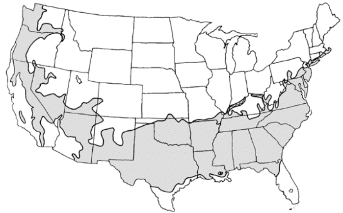
Figure 2. Range

Availability: somewhat available, may have to go out of the region to find the tree