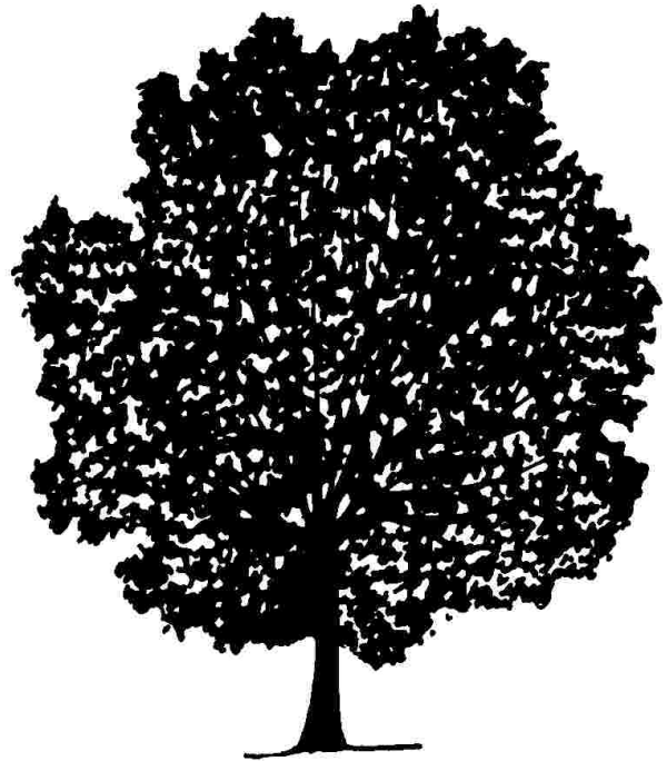
Figure 1. Middle-aged Quercus texana : Texas Red Oak

Availability: somewhat available, may have to go out of the region to find the tree