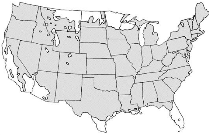
Figure 2. Range