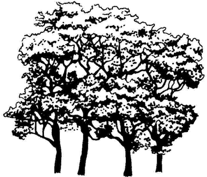
Figure 1. Middle-aged Sassafras albidum : Sassafras

This lovely, deciduous, native North American tree is pyramidal when young but later develops into a 30 to 60-foot-tall by 25 to 40-foot-wide, rounded canopy composed of many short, horizontal branches which give the tree a layered effect. For years, Sassafras was grown for the supposedly-medicinal properties of the fragrant roots and bark but it is the outstanding fall display of foliage which should bring it into the garden today. The large, multi-formed, five-inch leaves, fragrant when crushed, are bright green throughout the summer but are transformed into magical shades of orange/pink, yellow/red, and even scarlet/purple in the cooler months of autumn, brightening the landscape wherever they are found. These colors are especially prominent when Sassafras is planted as a specimen or in a mixed shrubbery border, with a background of dark evergreens.