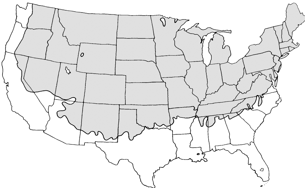
Figure 2. Range

Availability: somewhat available, may have to go out of the region to find the tree