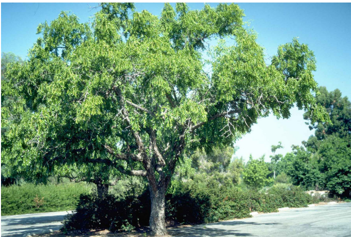
Figure 1. Young Ziziphus jujuba : Chinese Date

Availability: somewhat available, may have to go out of the region to find the tree