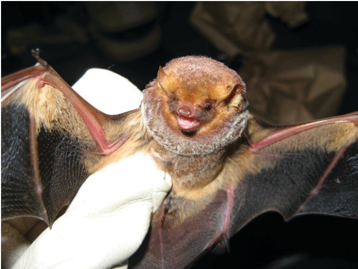
Figure 1. Seminole bat ( Lasiurus seminolus).