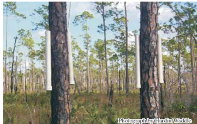
Figure 4. Polyvinyl chloride (PVC) pipes used as artificial refugia to capture treefrogs in a pine forest in Everglades National Park.

Amphibians are present in all habitats and under all hydrologic regimes in the Everglades. The species present and occupancy rates—the proportion of an area, or habitat, occupied (PAO) by a particular species—differ greatly across those gradients. These differences are due to hydropattern, vegetation, and other environmental factors. The combination of species composition and proportion of each habitat occupied at a given time form unique communities defined by those environmental factors. Therefore, if these communities can be reliably defined and measured, the Everglades restoration success can be evaluated, restoration targets can be established, and restoration alternatives can be compared.