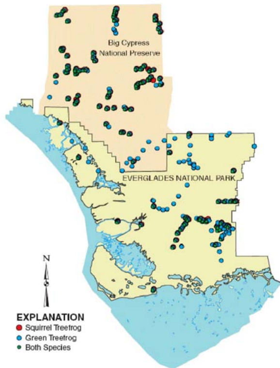
Figure 3. Location of Green Treefrogs ( Hyla cinerea ) and Squirrel Treefrogs ( Hyla squirella ) within Everglades National Park and Big Cypress National Preserve. Credits: Brian Jeffery, 2004

Treefrog ( Osteopilus septentrionalis ) on native treefrog populations. Cuban Treefrogs have been shown to be a predator of at least six species of native frogs and toads (Meshaka 2001) and at least one native snake (Maskell and others, 2003), and the Cuban Treefrog has become established in natural areas within Everglades National Park. We monitored populations of both native and the introduced species using capture data from artificial refugia (Figure 4). After one year of monitoring, all Cuban Treefrogs captured were removed from the area, and the recovery of native frogs was monitored. Results from this study indicated that Cuban Treefrogs can cause severe reductions in native treefrog abundance and survival in areas where Cuban Treefrog abundance is high. This estimation approach could also be applied to other stressors of amphibian populations, including alteration of the hydrologic cycle.