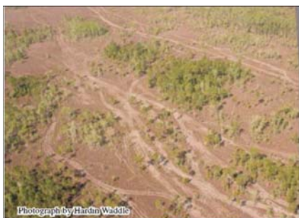
Figure 8. Trails left by off-road vehicles in the prairie habitat of Big Cypress National Preserve. Credits: Hardin Waddle, 2004

Meshaka, W.E. 2001. The Cuban Treefrog in Florida . Gainesville: University of Florida Press.