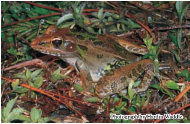
Figure 5. The southern leopard frog, Rana sphenocephala , a relatively large frog that frequents the shallow edges of grassy wetlands and flooded cypress forests in southern Florida. This is a species that will likely see a shift in the range during Everglades restoration.

a hydrologic gradient from very long hydroperiod sloughs to the extremely short hydroperiod rocky glades of eastern Everglades National Park. The outcome of this research will be community profiles relating the PAO of several key amphibian species to the ecological community along this gradient. This information can then be used by managers to make predictions and monitor success of CERP (Figure 6).