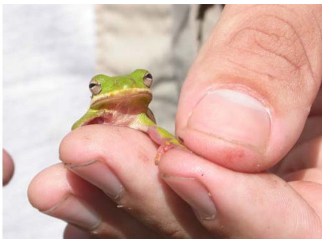
Figure 2. Green Treefrog ( Hyla cinerea ) captured in the marsh in Big Cypress National Preserve.

The Green Treefrog ( Hyla cinerea ) and Squirrel Treefrog ( Hyla squirella ) were the most commonly observed amphibian species during our recent inventories of Everglades National Park and Big Cypress National Preserve. These species were found in all habitats that we surveyed (Figure 3). While occurring together in many cases, the relative density