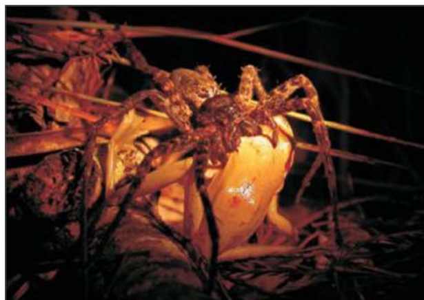
Figure 1. An Okefenokee fishing spider ( Dolomedes okefinokensis ) digesting a green treefrog ( Hyla cinerea ) in a cypress dome in Big Cypress National Preserve. This is one of a few documented cases of arthropods as predators of frogs.

Declines in amphibian populations have been documented by scientists worldwide from many regions and habitat types (Alford and Richards 1999). No single cause for declines has been demonstrated, but stressors such as acid precipitation, environmental contaminants, non-native predators, disease agents, parasites, and the effects of ultraviolet radiation have all been suggested. Because of their susceptibility to these and other stressors, amphibians are important indicators of ecosystem health (Welsh and Ollivier 1998).