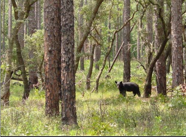
Figure 1. A Florida Black Bear in Northwestern Florida