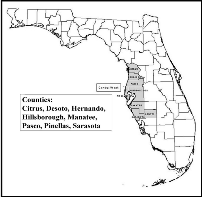
Figure 1. Central west Florida region with counties.

This document summarizes major rivers, lakes and springs, featured natural areas, and cultural aspects of Florida's central west region. For information on other regions in Florida, refer to "The Florida Environment: An Overview" and the other