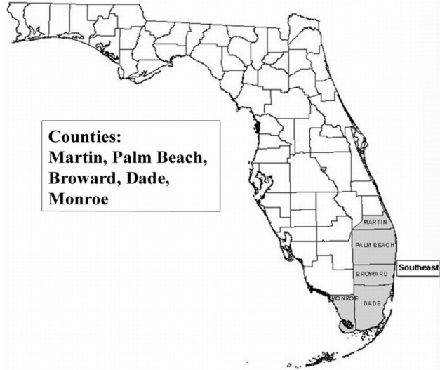
Figure 1. Southeast Florida region with counties.

This document summarizes major rivers, lakes and estuaries, featured natural areas, and cultural aspects of Florida's southeast region. For information