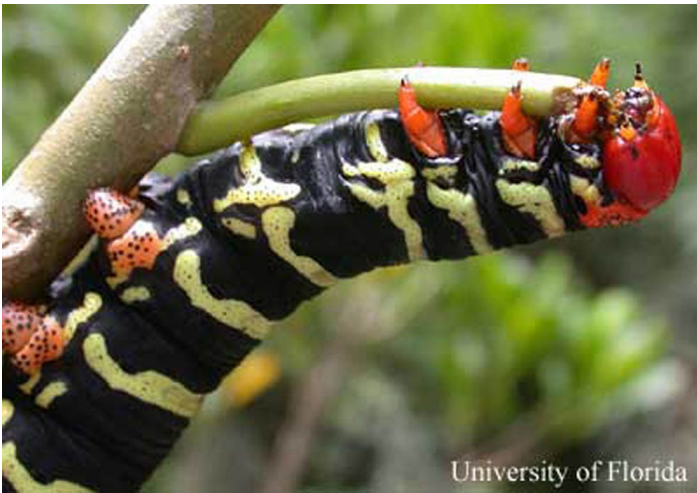
Figure 5. Close-up of Pseudosphinx tetrio (Linnaeus) larva feeding; Maricao Forest, Puerto Rico.