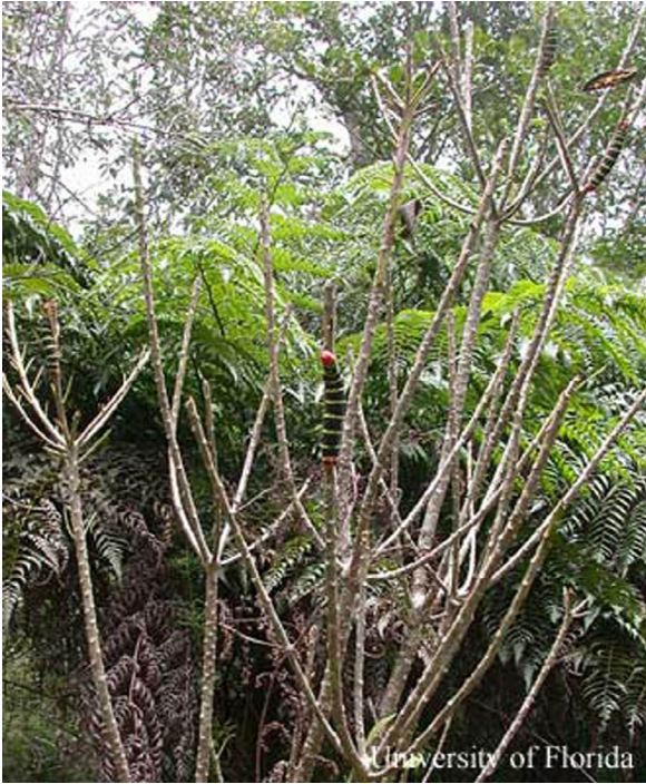
Figure 6. Pseudosphinx tetrio (Linnaeus) larvae defoliating a tree in Maricao Forest, Puerto Rico.