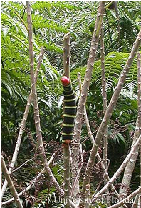
Figure 7. Closer view of Pseudosphinx tetrio (Linnaeus) larva defoliating a tree in Maricao Forest, Puerto Rico.