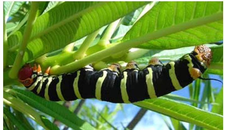
Figure 4. Pseudosphinx tetrio (Linnaeus) on Plumeria alba , Buck Island, St. Croix, U.S. Virgin Islands.

Pupae: Newly formed pupae are yellow, and after two to three hours brown spots appear on the surface. The pupal coloration eventually darkens to a yellowish-brown with lateral dark stripes on the thorax and rings on the abdomen. The final color after fully hardening is a uniform dark reddish-brown; pupal length is approximately 7.0 cm.