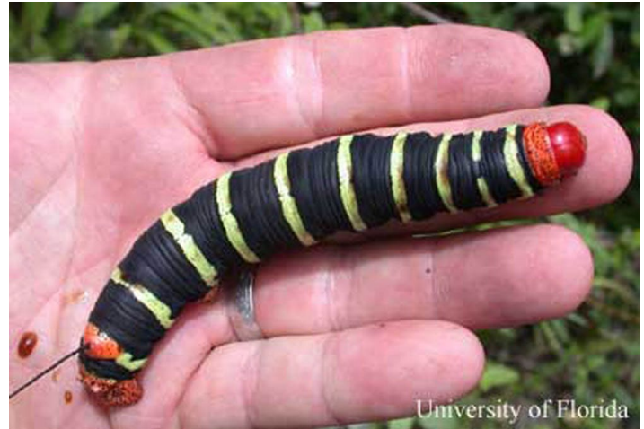
Figure 3. Pseudosphinx tetrio (Linnaeus) larva showing relative size on adult hand; Maricao Forest, Puerto Rico.

Larvae: Larvae are velvety black with yellow rings and a reddish-orange head. They can attain lengths of up to 6 inches. The black 'horn' located on abdominal segment 8 is approximately one inch long and is located on an elevated orange 'button'. Thoracic legs and prolegs are orange with black spots. Newly molted larvae are light yellow and dark gray in alternating transverse rings; several hours after molting, larvae become their typical yellow and black coloration.