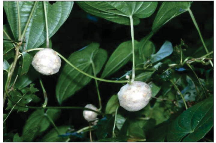
Figure 2. Air potato bulbils form in leaf axils.

from one point (Figures 3 and 4). Flowers are rare (in Florida), small, and fragrant, with male and female flowers arising from leaf axils on separate plants (i.e., a dioecious species) in panicles or spikes up to 4 in long (Figure 4). To date, only female plants have been found in Florida. Fruit is a capsule; seeds are partially winged.