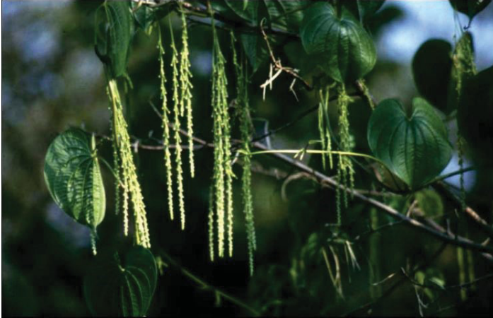
Figure 4. Air potato flowers.

shows air potato and winged yam growing alongside each other. Although not as abundant as air potato, winged yam nonetheless ranges from Escambia to Miami-Dade Counties ( Dioscorea alata - Species Page - ISB: Atlas of Florida Plants (usf.edu)) and is likely now more prevalent than previously thought. Winged yam can produce massive edible tubers (Figure 6), some of which have been recorded to weigh over 100 pounds.