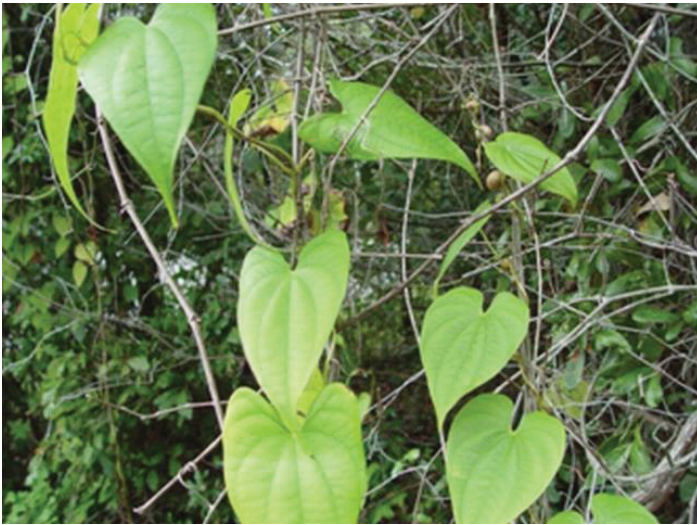
Figure 5. Side-by-side comparison of winged yam (left) and air potato (right).

Three other introduced species of Dioscorea may be encountered in Florida: Chinese yam ( D. polystachya , high invasion risk), Zanzibar yam ( D. sansibarensis , high invasion risk), and ornamental yam ( D. dodecaneura , unknown invasion risk). Our native wild yams ( D. villosa and D. floridana ) are infrequent in hammocks and floodplains of northern and western Florida; these never form aerial tubers and have leaf blades that rarely reach 6 in long.