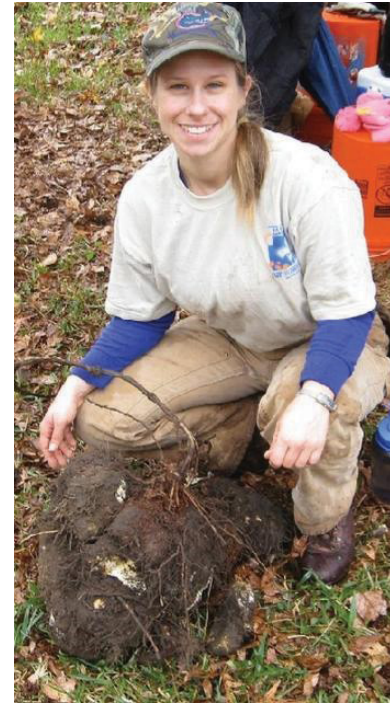
Figure 6. Underground tuber of winged yam.

Three other introduced species of Dioscorea may be encountered in Florida: Chinese yam ( D. polystachya , high invasion risk), Zanzibar yam ( D. sansibarensis , high invasion risk), and ornamental yam ( D. dodecaneura , unknown invasion risk). Our native wild yams ( D. villosa and D. floridana ) are infrequent in hammocks and floodplains of northern and western Florida; these never form aerial tubers and have leaf blades that rarely reach 6 in long.