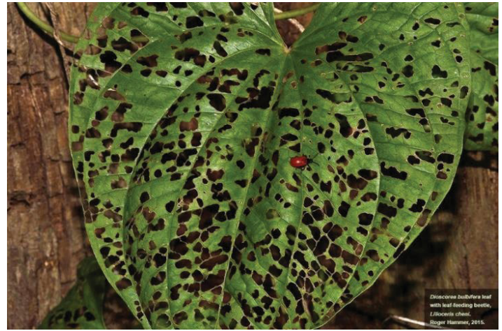
Figure 8. Dioscorea bulbifera leaf damage by the air potato leaf beetle, Lilioceris cheni .

The air potato leaf beetle feeds on the leaves and causes a skeleton-like appearance (Figure 8). The damage can be so severe that aerial bulbil production, climbing ability, and competitive nature of air potato are all greatly reduced. The insect does not eradicate air potato, but the damage it inflicts makes this insect a growing success story for biological control in Florida. For more information on the biology and ecology of the air potato leaf beetle, see EDIS publication EENY-547, Air Potato Leaf Beetle (Suggested Common Name) , Lilioceris cheni Gressitt and Kimoto ( Insecta: Coleoptera: Chrysomelidae: Criocerinae ) ( https://edis.ifas.ufl.edu/in972 ). The insect has been widely distributed throughout Florida at thousands of release sites. Currently, availability of the insect for continued distribution is handled by FDACS ( https://www.fdacs.gov/Agriculture-Industry/Pests-and-Diseases/Plant-Pests-and-Diseases/Biological-Control/Air-Potato-Vine-Biological-Control ) because the UF/IFAS redistribution program ended in 2019.