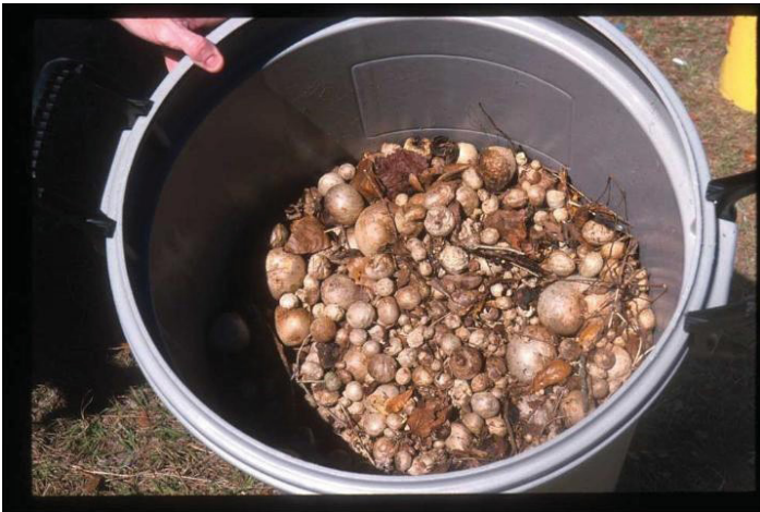
Figure 7. Remove air potato bulbils and other plant material from the site and dispose of in such a way that they do not spread the vines to new areas.