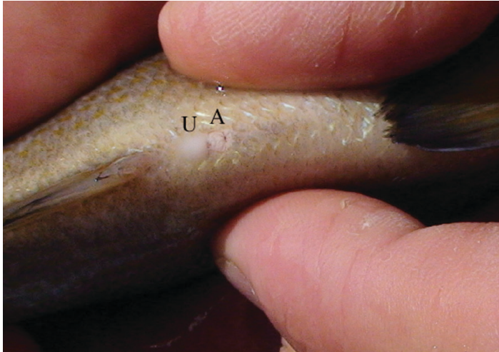
Figure 2. Strip-spawning of a pigfish male, displays milt expressed from the urogenital opening (U) posterior to the anus (A).

prior to spawning. An examination of the nutritional content of wild pigfish larvae could divulge the proper nutrients needed for a broodstock diet and subsequent optimal larval development. Pigfish broodstock at IRREC were fed a combination of a 2.0 mm slow-sinking, pelleted commercial diet (containing 50% crude protein and 15% crude lipid) and frozen squid.