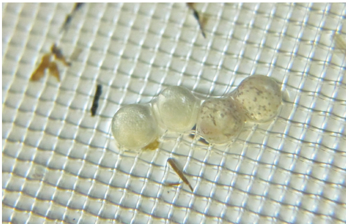
Figure 3. An example of unfertilized eggs (left) and fertilized eggs (right) of Gulf killifish.

Eggs are collected from Spawntex (Blocksom & Co., Michigan City, IN, USA) spawning mats that are suspended horizontally 8–10 in (20–25 cm) below the broodstock pond surface. Eggs are mildly adhesive but lose most of their adhesiveness 24 hours after they are spawned. Eggs can then be removed from the spawning mats by shaking or beating the mats over a tub filled with a few inches of water. After removal from the mat, eggs are rinsed and cleaned over a 1–1.5 mm screen and enumerated volumetrically (approximately 114 eggs/mL) (Green et al. 2010; Ramee 2015). The percent fertilization of the eggs can also be easily assessed at this time. When first collected, eggs will appear clear with a brown/yellow tint. As they develop, dead or unfertilized eggs will turn white and opaque, while healthy eggs will first look as if they have been sprinkled with pepper (appearance of chromatophores or pigment-containing cells) (Figure 3). Following this stage, eyes and eventually the embryo's beating heart will become visible through the clear outer membrane.