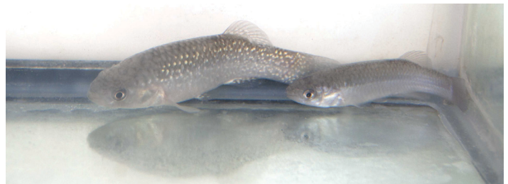
Figure 1. Male (left) and female (right) Gulf killifish, Fundulus grandis .

4 inches (10.2 cm). An unpublished University of Florida IFAS survey identified the Gulf killifish and two related species as having the highest priority for development of an aquaculture-based live bait industry. Gulf killifish have distinctive superior or upturned mouths that allow them to feed efficiently on floating prey or diets. As adults, male Gulf killifish, as pictured on the left in Figure 1, generally have iridescent speckles on the sides of their bodies and a white or transparent strip on the distal (back) edge of an otherwise pigmented caudal (tail) fin. Breeding males will acquire a “beard,” or darkening of the underside of the head and gill plates. Females, as depicted on the right in Figure 1, maintain a drab olive-brown color throughout the year with no speckles.