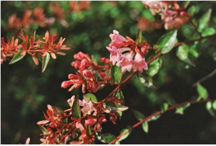
Figure 4. Flower— Abelia x grandiflora : glossy abelia. Credits: Edward F. Gilman, UF/IFAS