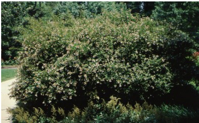
Figure 1. Full Form, Natural— Abelia x grandiflora : glossy abelia.