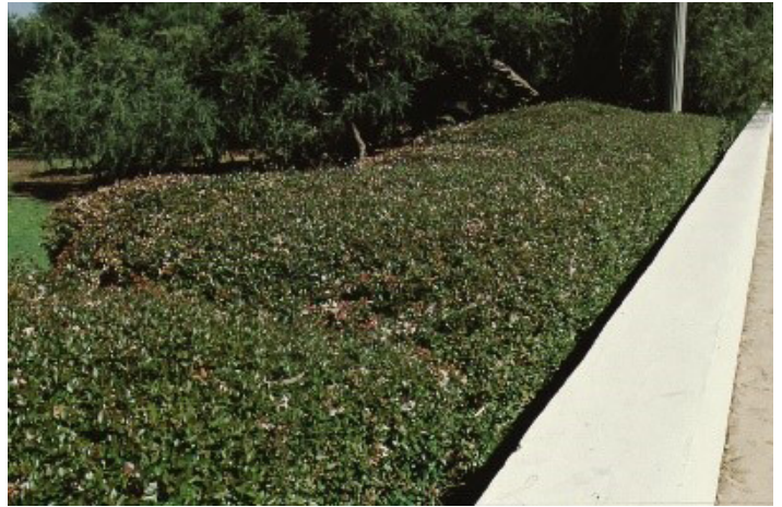
Figure 2. Full Form, Manicured— Abelia x grandiflora : glossy abelia. Credits: UF/IFAS

Glossy abelia is a fine-textured, semi-evergreen, sprawling shrub with 1½ inch-long, red-tinged leaves arranged along thin, arching, multiple stems. It is a hybrid between A. chinensis and A. uniflora . It stands out from other plants because the leaves retain the reddish foliage all summer long, whereas many plants with reddish leaves lose this coloration later in the summer. Considered to be evergreen in its southern range, glossy abelia will lose 50% of its leaves in colder climates, and the remaining leaves will take on a more pronounced red color. Reaching a height of 6 to 10 feet with a spread of 6 feet, the gently rounded form of glossy abelia is clothed from spring through fall with terminal clusters of delicate pink and white, small, tubular flowers. Multiple stems arise from the ground in a vase shape, spreading apart as they ascend into the foliage.