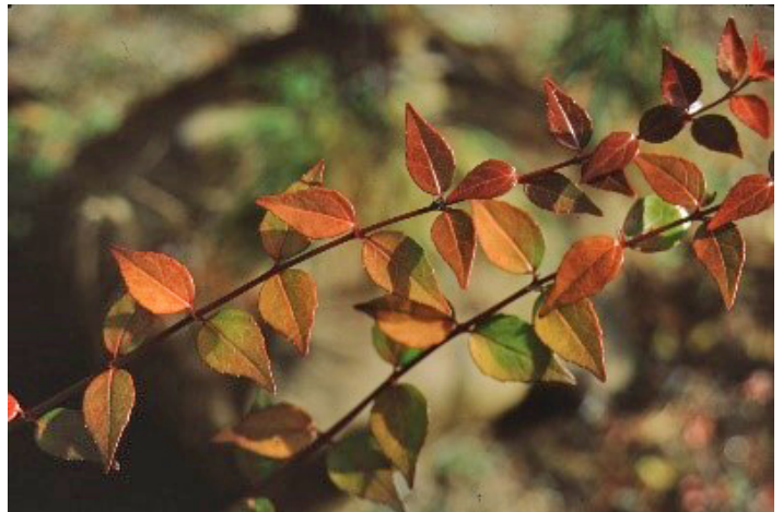
Figure 3. Leaf— Abelia x grandiflora : glossy abelia.