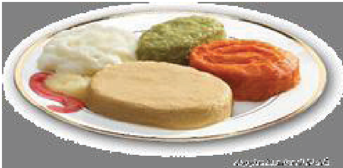
Figure 1. Purees of different textures and colors.

Puréed foods are prepared by mashing, grinding, or chopping food until a very fine, smooth texture is achieved. Mashed potatoes, squash, and pumpkin pie filling are examples of puréed foods. Although we all enjoy puréed foods as a part of a healthy diet, puréed diets may be recommended for frail people who have chewing and/or swallowing problems.