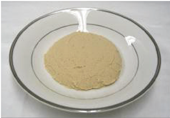
Figure 3. Pureed chicken.