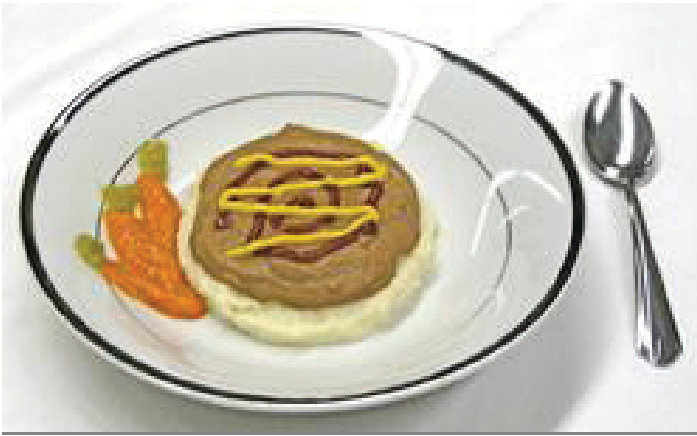
Figure 4. A puréed hamburger.