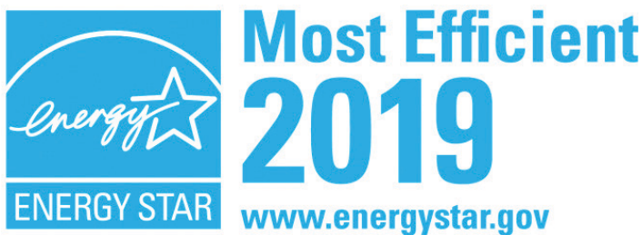
Figure 3. Sample ENERGY STAR Most Efficient logo for use on qualified products only.