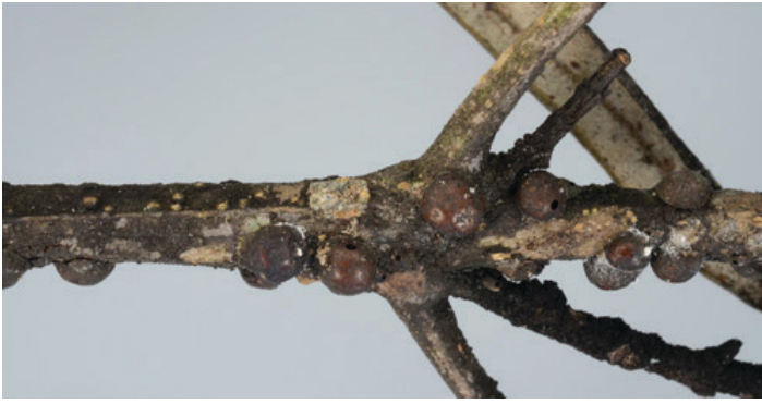
Figure 4. Sooty mold on cultivated olive ( Olea europaea L.) leaves and stems indicates the presence of adult black scales, Saissetia oleae (Olivier).