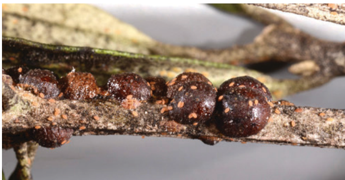
Figure 1. Adult female black scales, Saissetia oleae (Olivier) on cultivated olive ( Olea europaea L.).

The black scale, Saissetia oleae (Olivier 1791) (Hemiptera: Coccidae) is an important pest of citrus and olive trees. Originally from South Africa, this scale is now distributed worldwide. In Florida, black scale is found on citrus ( Citrus spp.), cultivated olive ( Olea europaea L.), avocado ( Persea americana Mill.), and many popular landscape plants. It is likely that black scale, like many invasive pests, was imported to the United States on infested nursery plants. Based on their small size and the unique life history of scale insects, these insects are difficult to detect and control.