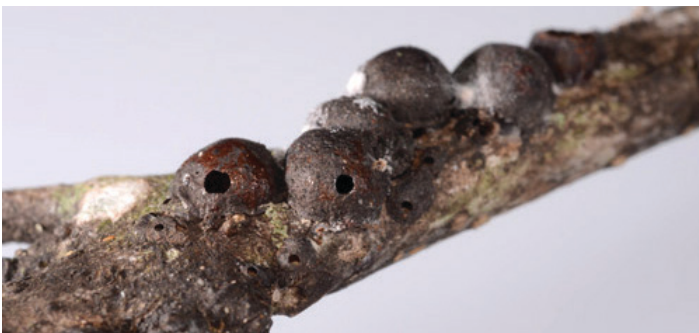
Figure 5. Exit holes in adult black scales, Saissetia oleae (Olivier), indicating the presence of the parasites that aid in black scale control.

The primary method of black scale management is biological control. Classical biological control is a strategy commonly used for invasive pests and involves importation of the invasive pest's natural enemies from the pest's native region. The parasitoid wasps Metaphycus helvolus (Compere) and Metaphycus lounsburyi (Howard) (Hymenoptera: Encyrtidae), also native to South Africa, have been released for control of black scale in olive and citrus fields (Figure 5). Though closely related, parasitoids differ in their life histories. Metaphycus helvolus attacks second or third instar black scale nymphs whereas Metaphycus lounsburyi parasitizes third instar nymphs and adult females. These parasitoids are typically released for augmentative control of the black scale, though some established populations have been reported.