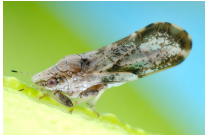
Figure 2. Adult Asian citrus psyllid, Diaphorina citri Kuwayama.

The adults are 3 to 4 mm long with a mottled brown body. The head is light brown, whereas T. erytreae has black head. The forewing is broadest in the apical half, mottled, and with a brown band extending around the periphery of the outer half of the wing. This band is slightly interrupted near the apex (in T. erytreae , band is broadest at middle, unspotted and transparent). The antennae have black tips with two small, light brown spots on the middle segments (in T. erytreae , antennae are nearly all black). A living D. citri is covered with whitish, waxy secretion, making it appear dusty.