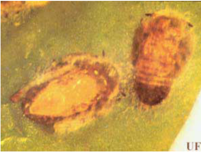
Figure 13. Nymphs of the Asian citrus psyllid, Diaphorina citri Kuwayama, killed by the ectoparasitoid wasp Tamarixia radiata .

In the United States and its territories, areas with D. citri are under quarantine (USDA 2010a). International quarantines, enacted by other countries, may also be placed on countries with D. citri .