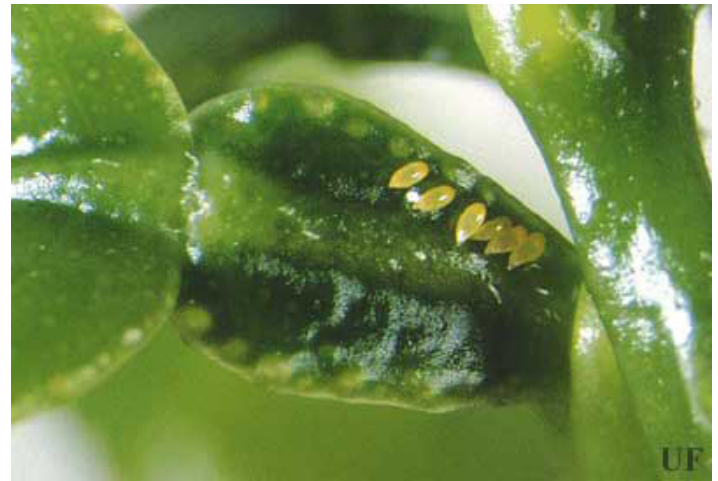
Figure 6. Eggs of the Asian citrus psyllid, Diaphorina citri Kuwayama.

Psyllids as a group are most likely to be confused with aphids as these latter insects are common on tender citrus leaves. But adult psyllids are active jumping insects and aphids are sluggish. In addition, aphids usually have four- to six-segmented antennae, while psyllid antennae usually have 10 segments. Most aphids have cornicles on the abdomen, while psyllids lack cornicles.