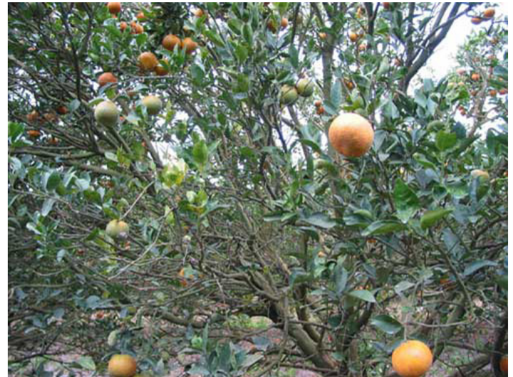
Figure 10. Twig dieback caused by Huanglongbing or greening disease to a Murcott tree.

The nymphs are always found on new growth, and move in a slow, steady manner when disturbed.