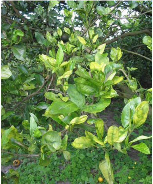
Figure 9. Huanglongbing or greening disease damage to a sweet orange tree.

Capoor et al. (1974) described greening symptoms of citrus as trees showing stunted growth, sparsely foliated branches, unseasonal bloom, leaf and fruit drop, and twig dieback. Young leaves are chlorotic, with green banding along the major veins. Mature leaves have yellowish-green patches between veins, and midribs are yellow. In severe cases, leaves become chlorotic and have scattered spots of green. Fruits on greened trees are small, generally lopsided, underdeveloped, unevenly colored, hard, and poor in juice. The columella (the internal, central columnlike structure found in citrus and other fruits) was found to be almost always curved in sweet orange fruits and apparently is the most reliable diagnostic symptom of greening. Most seeds in diseased fruits are small and dark colored.