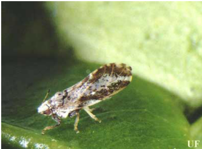
Figure 1. Adult Asian citrus psyllid, Diaphorina citri Kuwayama.

The Asian citrus psyllid, Diaphorina citri Kuwayama, is widely distributed in southern Asia. It is an important pest of citrus in several countries as it is a vector of a serious