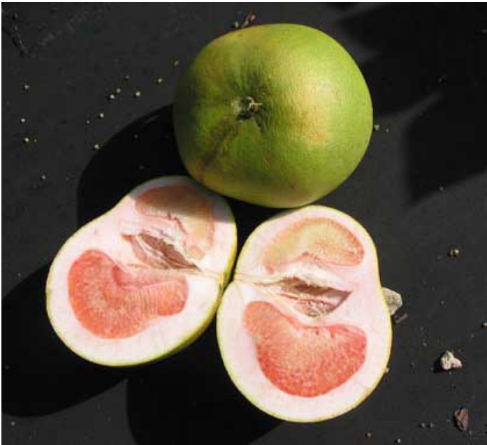
Figure 11. Grapefruit damage caused by Huanglongbing or greening disease. Lopsided fruit are a symptom of greening disease. Note the extreme distortion of the columella, the central columnlike structure found in citrus and other fruits.