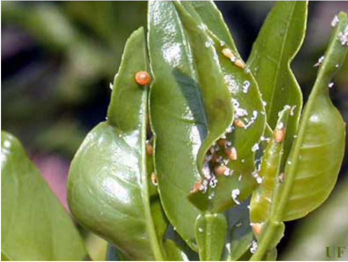
Figure 4. The white waxy excretions of the nymphs are an indicator of the Asian citrus psyllid, Diaphorina citri Kuwayama.

are confined to the apical plate of the abdomen (in T. erythrae , there is a fringe of fine white filaments around the whole body, including head).