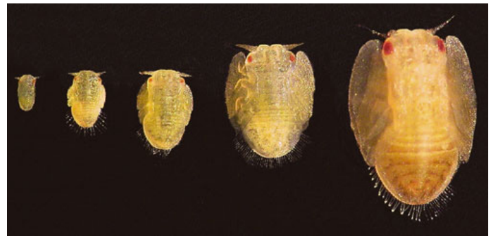
Figure 3. Nymphal stages of the Asian citrus psyllid, Diaphorina citri Kuwayama.

Diaphorina citri nymphs are 0.25 mm long during the 1st instar, and 1.5 to 1.7 mm in last (5th) instar. Their color is generally yellowish-orange. There are no abdominal spots, whereas in T. erytreae , advanced nymphs have two basal dark abdominal spots. The wing pads in D. citri are large, while T. erytreae has small pads. In D. citri , large filaments