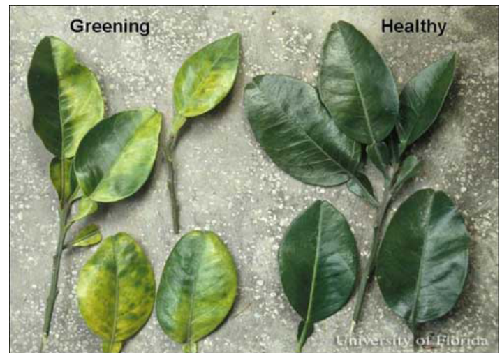
Figure 12. Symptoms of greening disease, Liberobacter spp., on citrus.

Diaphorina citri requires an incubation period before it can transmit the pathogen, which it retains for life following a short access feeding (15 to 30 minutes) on a diseased plant. Infectious nymphs retain their ability to vector the disease into adulthood. Adult psyllids transmit the pathogen that causes greening after feeding for as little as 15 minutes, but transmission was low. One hundred percent infection was obtained when the psyllids fed for one hour or more. Capoor et al. (1974) indicated that the pathogen multiplied in the body of the psyllid and that there was an absence of transovarial transmission. They summarized differences between D. citri and Trioza erytrae in various aspects of greening transmission.