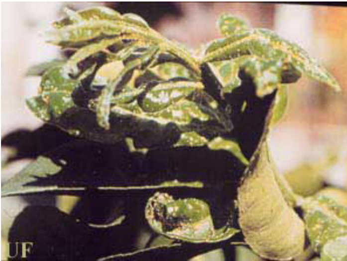
Figure 8. Feeding damage caused by the Asian citrus psyllid, Diaphorina citri Kuwayama, to citrus foliage.