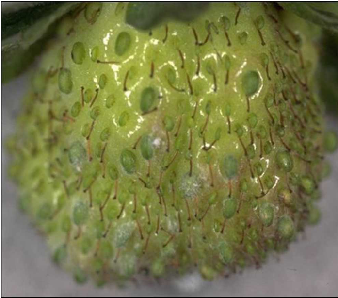
Figure 6. Podosphaera aphanis on strawberry achenes.

such as elemental sulfur. Systemic fungicides have some limited curative action. These include Quintec (quinoxifen) and Torino (cyflufenamid), which have different modes of action and can be applied in alternation. Another group of products include Rally® (myclobutanil), which was formerly named Nova®; Procure® (triflumizole); Orbit® (propiconazole); and Mettle (tetraconazole). These products are treated as a group since they belong to the same fungicide class and have similar properties. For this reason, they should be rotated with other fungicides with different properties to avoid the development of resistance. Other rotational options include Merivon® (pyraclostrobin + fluxapyroxad) and Fontelis™ (penthioapyrad). None of these products should be applied more than four times per season. Usually, controlling foliar infection helps to prevent fruit infection.