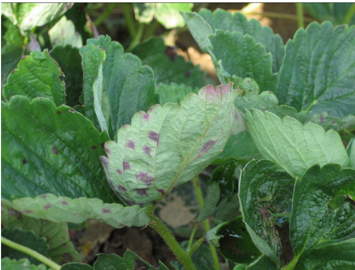
Figure 3. Reddish-brown spot reaction caused by Podosphaera aphanis in some cultivars.