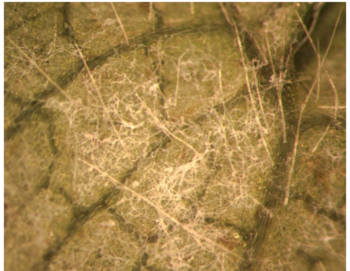
Figure 1. Podosphaera aphanis mycelia on strawberry leaf surface.

P. aphanis infects leaves, flowers, and fruit. Early foliar infections are characterized by small white patches of fungus growing on the lower leaf surface. On susceptible cultivars, dense mycelial growth and numerous chains of conidia (spores) give these patches a powdery appearance (Figure 1). Under favorable conditions, the patches expand and coalesce until the entire lower surface of the leaf is covered (Figure 2). In some strawberry cultivars, relatively little mycelium is produced, making it difficult to see the white patches. Instead, irregular yellow or reddish-brown spots develop on colonized areas on the lower leaf surface and eventually break through to the upper surface (Figure 3). The edges of heavily infected leaves curl upward (Figure 4). At times, dark round structures (cleistothecia) are produced in the mycelia on the undersides of leaves (Figure 5). Cleistothecia are initially white but turn black as they mature. The fungus also infects flowers, which may produce aborted or malformed fruit. In addition, P. aphanis colonizes older fruit, producing a fuzzy mycelial growth on the seeds (Figure 6). Both types of infection may reduce fruit quality and marketable yields.