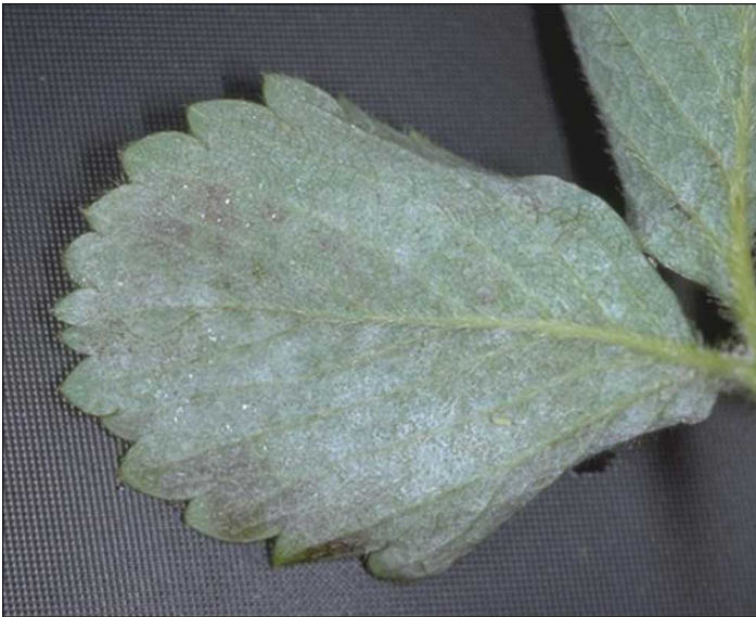
Figure 2. Lower leaf surface of strawberry covered with powdery mildew.