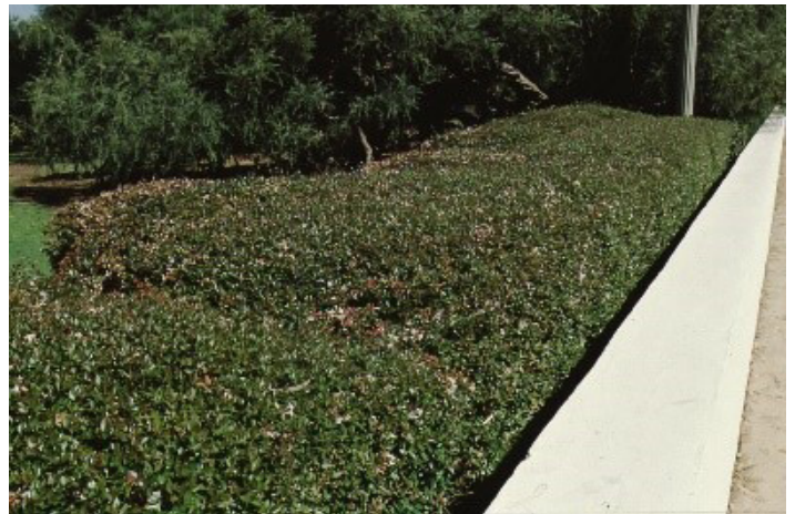
Figure 2. Full Form, Manicured— Abelia x grandiflora : glossy abelia.