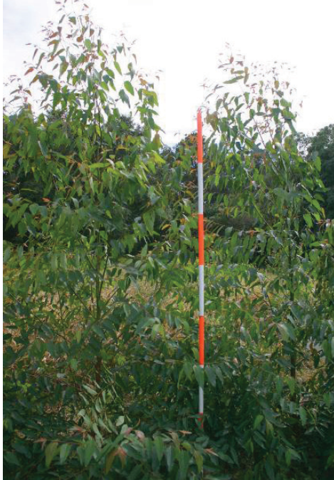
Figure 2. In the same Quincy study, E. urograndis grown with near complete weed control is nine to ten feet tall at the same age.

endorsement of a product or a company because other products manufactured by different companies might be equally suited for the intended use. It must be noted, however, that two herbicides with the same active ingredient can have very different labels and use patterns. For example, Alligare SFM 75 is labeled for Eucalyptus (supplemental labeling), while DuPont Oust® XP is not, even though both contain 75% sulfometuron methyl active ingredient. It is essential that the herbicide you choose is specifically labeled for Eucalyptus culture in Florida (personal communication, Charlie Clarke, Florida Department of Pesticide Registration, November 30, 2009).