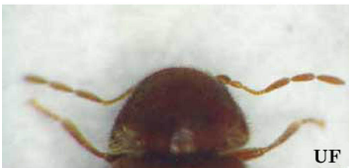
Figure 3. Serrated antennae of a cigarette beetle, Lasioderma serricornes (F.), (top); clubbed antennae of a drugstore beetle, Stegobium paniceum (L.) (bottom).