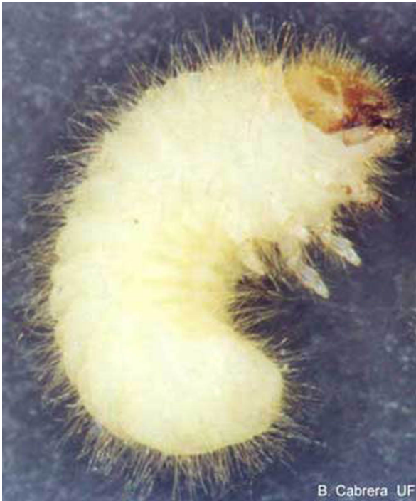
Figure 6. Larva of the cigarette beetle, Lasioderma serricornes (F.).