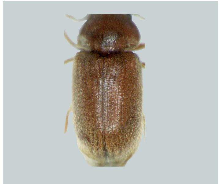
Figure 4. Striated elytra of an adult drugstore beetle, Stegobium paniceum (L.).