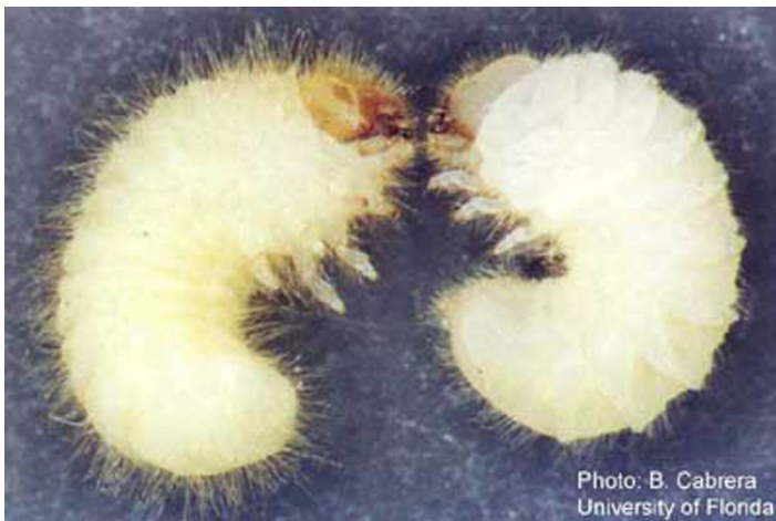
Figure 7. Comparison of a larva of a cigarette beetle, Lasioderma serricornes (F.), (left); and the drugstore beetle, Stegobium paniceum (L.) (right).