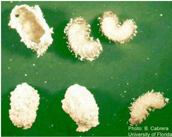
Figure 8. Larvae and cocoons of the cigarette beetle, Lasioderma serricorne (F.).