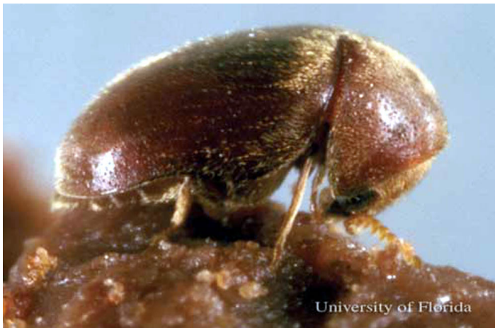
Figure 2. Adult cigarette beetle, Lasioderma serricornes (F.).

They prefer to reside in dark or dimly lit cracks, nooks and crevices but become active and fly readily in bright, open areas, probably in an attempt to find refuge. They are most active at dusk and will continue activity through the night. Adults do not feed but will drink liquids. Cigarette beetles look almost identical to drugstore beetles but can be distinguished by two easily identifiable characters: the antennae of the cigarette beetle are serrated (like the teeth on a saw) while the antennae of the drugstore beetle are not and end in a 3-segmented club. The other difference is that drugstore beetle elytra have rows of pits giving them a striated (lined) appearance while those of the cigarette beetle are smooth.