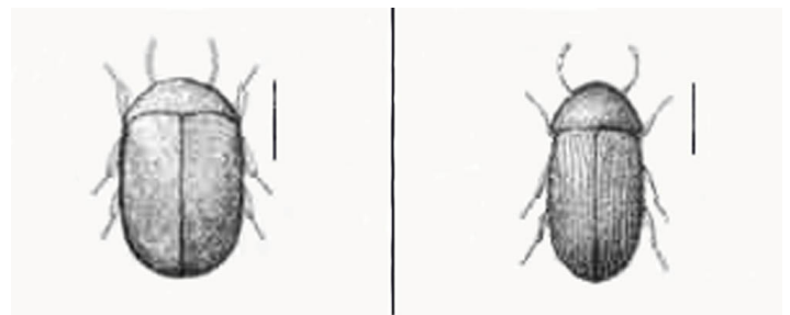
Figure 5. Comparison of the elytra and antennae of the cigarette beetle, Lasioderma serricornes (F.), (left), and drugstore beetle, Stegobium paniceum (L.) (right).