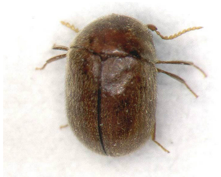
Figure 1. Adult cigarette beetle, Lasioderma serricorne (F.).

The cigarette beetle is pan-tropical but can be found worldwide -- especially wherever dried tobacco in the form of leaves, cigars, cigarettes, or chewing tobacco is stored.