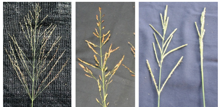
Figure 1. From left to right, guinea grass seedhead; johnsongrass seedhead; and vaseygrass seedhead.

All three grasses are perennial, but only johnsongrass has a creeping rhizome system and grows in patches rather than in individual bunches. Vaseygrass and guinea grass are both bunch-type grasses without a significant rhizome system. Additionally, vaseygrass is most commonly found in wet