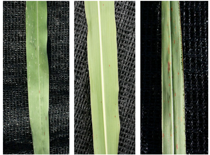
Figure 4. From left to right, guinea grass leaf blade; johnsongrass leaf blade; vaseygrass leaf blade.

Johnsongrass leaves have a large white midrib and a smooth, glossy appearance. Guinea grass leaves have a less prominent white midrib, and the undersides are rough with stiff hairs. Vaseygrass leaves are long and narrow with an indented midrib and crinkled leaf margins.