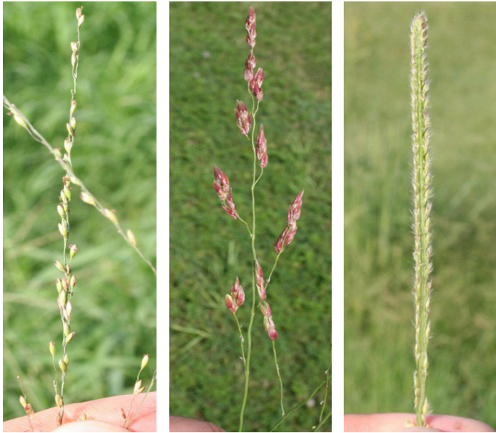
Figure 2. From left to right, guinea grass seedhead branch; johnsongrass seedhead branch; and vaseygrass spikelet.

Guinea grass has small, oval, light green seeds, which often have wrinkles. Vaseygrass seeds have similar characteristics but are flatter, with the presence of hairs. Johnsongrass has much larger, pointed seeds that develop a reddish/brown tint as they mature.