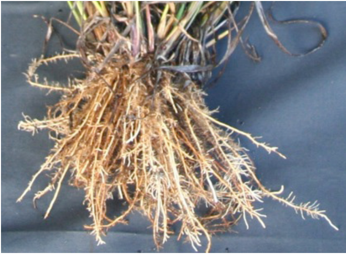
Figure 7. Vaseygrass root structure