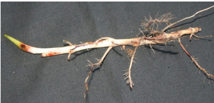
Figure 8. Johnsongrass rhizome Credits: Brent Sellers, UF/IFAS