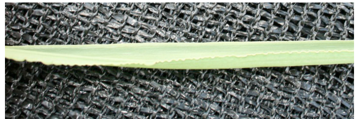
Figure 5. Vaseygrass leaf margin.