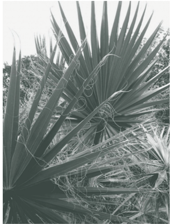
Figure 2. Washingtonia filifera leaves—note filaments hanging from leaf margins.

palm), and Washingtonia (Washington palm; Figure 2). Refer to Table 1 for specific species and their cold hardiness information. Other cold hardy palms may be found at better garden centers and specialty nurseries.