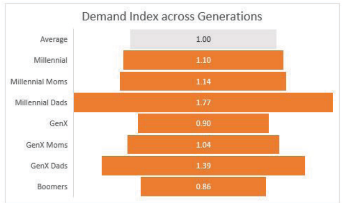
Figure 4. Demand index across generations.

by dividing the current demand level by itself, which is one. We can see that the demand index of the millennials is 1.10, which indicates that if all the consumers are millennials, OJ demand would increase by 10% through enhancing both market penetration and market intensity. Across consumer groups, millennial dads (1.77) and Generation X dads (1.39) have the strongest demand. The interpretations of these measures are millennial dads' demand for OJ is 1.77 times average, and Generation X dads' demand for OJ is 1.39 times average. Together, the millennials show a slightly stronger demand than Generation X and the boomer generation. Surprisingly, millennial dads and Generation X dads outperform their counterparts in terms of OJ purchases. However, we need to keep in mind that these groups only account for about 8% and 4% of the total sample, respectively.