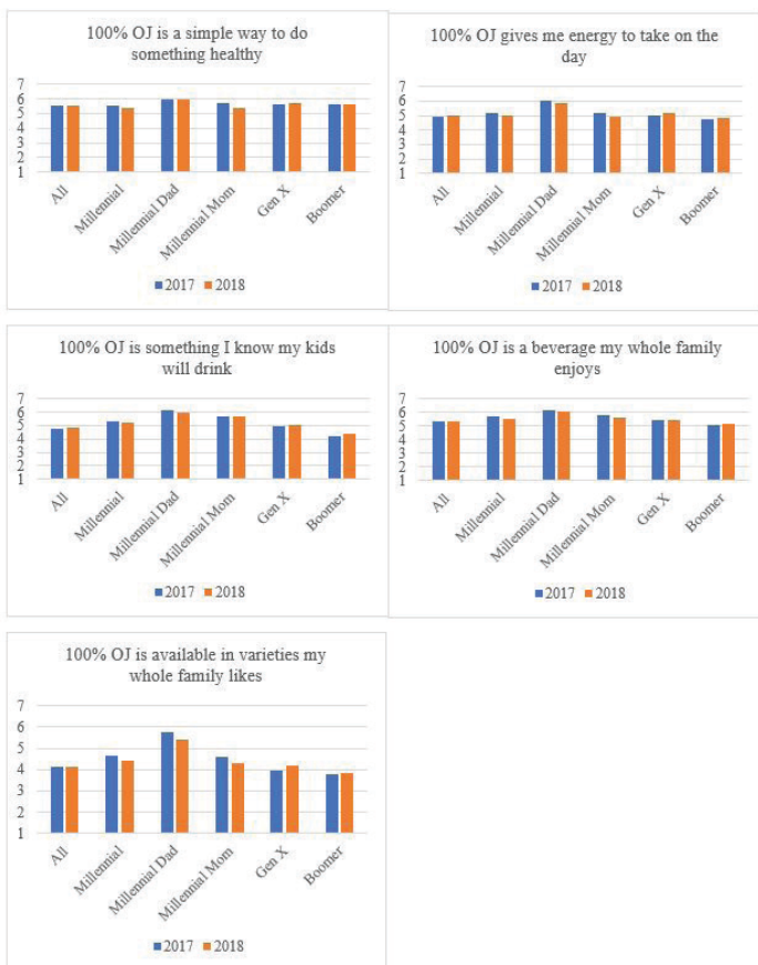
Figure 2. Consumers' positive perceptions of OJ.

Heng, Y., Z. Gao, Y. Jiang, and X. Chen. 2018. "Exploring hidden factors behind online food shopping from Amazon reviews: A topic mining approach." Journal of Retailing and Consumer Services 42: 161–168. https://doi.org/10.1016/j.jretconser.2018.02.006