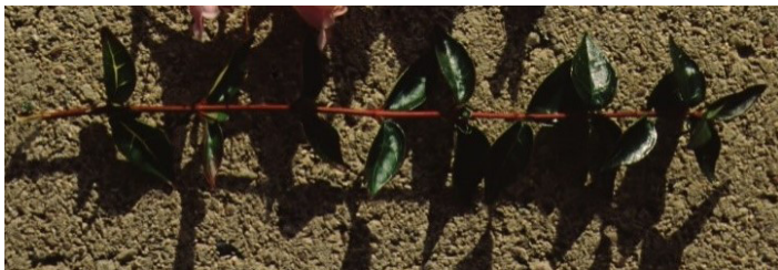
Figure 1. Leaf - Abelia x grandiflora 'Edward Goucher' - 'Edward Goucher' glossy abelia.

Glossy abelia is a fine-textured, semi-evergreen, sprawling shrub with 1.5-inch-long, red-tinged leaves arranged along thin, arching, multiple stems. It is a hybrid between A. chinensis and A. uniflora . It stands out from other plants because the leaves retain the reddish foliage all summer long, whereas many plants with reddish leaves lose this coloration later in the summer. Considered to be evergreen in its southern range, glossy abelia will lose 50% of its leaves in colder climates, the remaining leaves taking on a more pronounced red color. Reaching a height of 6 to 10 feet with a spread of 6 feet, the gently rounded form of glossy abelia is clothed from spring through fall with terminal clusters of delicate pink and white, small, tubular flowers. Multiple stems arise from the ground in a vase shape, spreading apart as they ascend into the foliage.