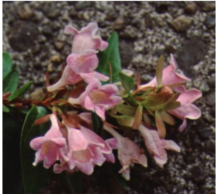
Figure 2. Flower - Abelia x grandiflora 'Edward Goucher' - 'Edward Goucher' glossy abelia.