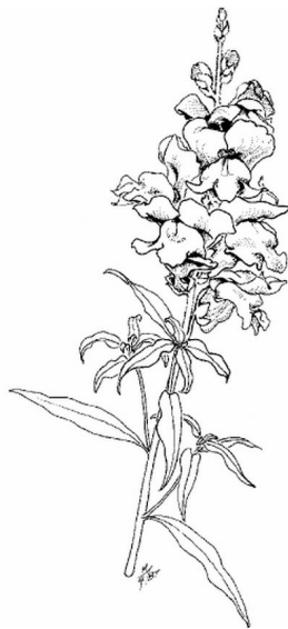
Figure 1. 'Tahiti' snapdragon.

This dwarf type of Snapdragon makes a great bedding plant six to fifteen inches tall (Fig. 1). The flowers come in a wide range of colors from red, orange, yellow, and maroon. Plants with dark colored flowers have dark green or reddish stems and those with white or pale flowers have pale green stems. Snapdragons grow in any slightly acid, garden soil, however, they do not grow well in unamended clay. The plants require full sun and moist soil. A second crop of flowers may be obtained from plants that have finished flowering. Cut them back to within 5 or 6 nodes of the ground when the first flowers fade. Fertilize when the second crop of flower buds become visible.