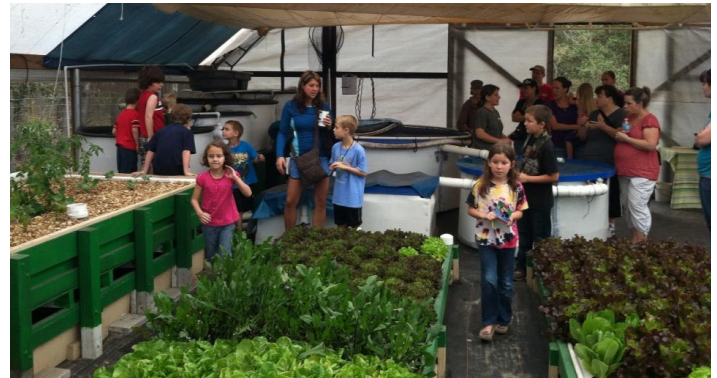
Figure 1. Aquaponic media filled bench bed (left) floating raft system (right) and recirculating tanks and filters (top) at Green Acre Aquaponics, Brooksville, FL.

Aquaponics is an intensive sustainable agricultural production system that connects hydroponic and aquaculture systems to produce multiple cash crops with reduced water and fertilizer inputs. It is highly suited for small farm producers targeting local markets and agritourism opportunities (Figure 1).