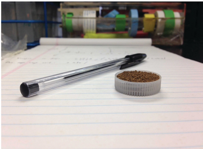
Figure 1. One full cap of soil. The volume of the cap is 0.8 tsp, and one cap dry soil is approximately 0.13 to 0.19 oz.