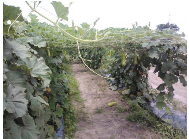
Figure 1. Long squash vines on trellis.

has smooth, light green skin with white flesh and should be harvested young for culinary use (Figure 2). If harvested when mature and dried, the fruit will not be edible. The dried, buoyant, hard-shelled fruit have long been used as water and food containers, musical instruments (drums and flutes), fishing floats, apparel, etc. The fruit of this crop have a variety of shapes: round (called calabash), high round, cylindrical, bottle or dumbbell, slim and serpentine, or long. Most of the long squash varieties grown in Florida have long fruit (Figure 2).