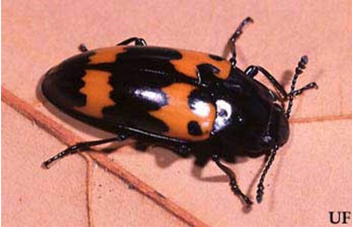
Figure 2. Adult pleasing fungus beetle, Megalodacne spp.

than 10 mm in length. Body shape usually is elongate-oval or egg-shaped. Useful references for identifying these beetles are Boyle (1956) and Dillon and Dillon (1961).