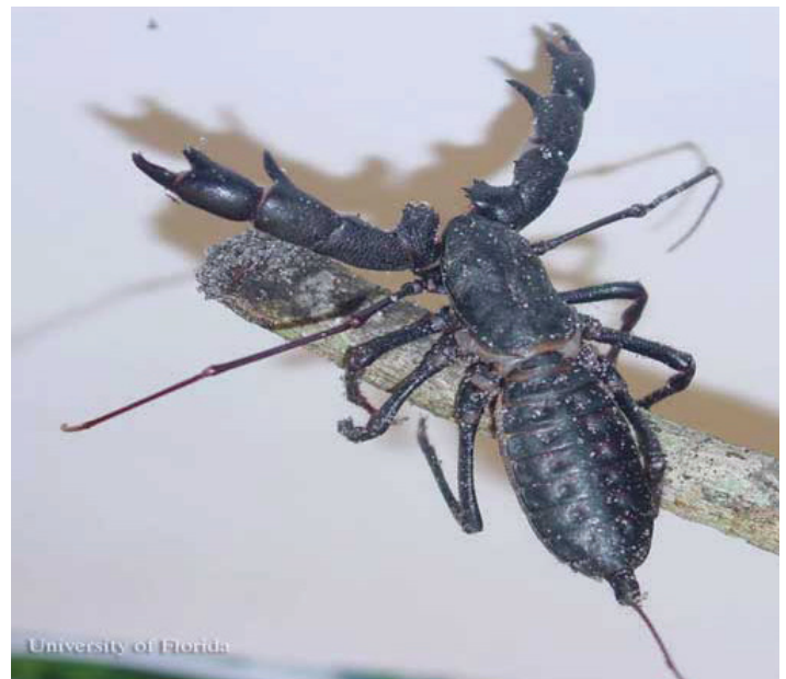
Figure 1. The giant whip scorpion or ‘vingaroon’, Mastigoproctus giganteus giganteus (Lucas).

shrimp can deliver to an unsuspecting finger during sorting of the shrimp from the by-catch.