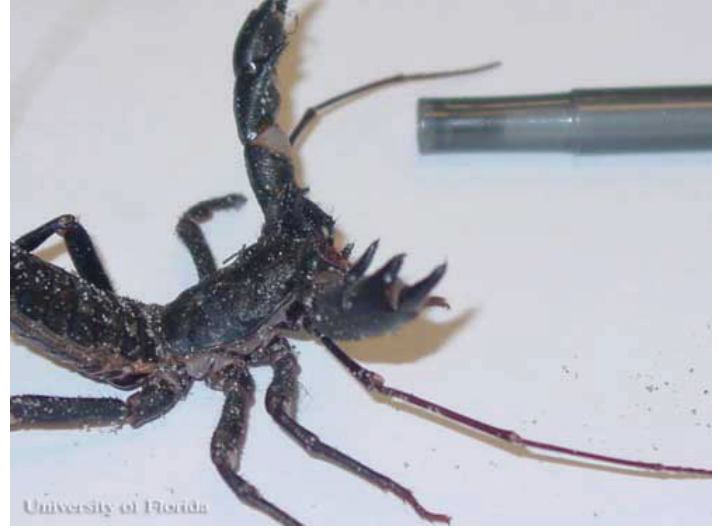
Figure 5. The giant whip scorpion or 'vingaroon', Mastigoproctus giganteus giganteus (Lucas), displaying defensive stance with spread pedipalps.

When threatened, vingaroons seek the refuge of their burrows or put on a bluff display of rearing up and spreading their pedipalps. They can also accurately spray acetic acid from a pore at the base of the caudal filament to a distance of a few inches to one foot. This defensive spray is not dangerous to skin but stings severely if it gets into an animal's eyes or nostrils.