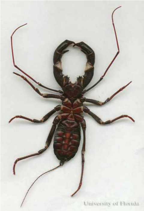
Figure 3. Ventral view of the giant whip scorpion or 'vingaroon', Mastigoproctus giganteus giganteus (Lucas).

arid habitats with well drained soil. They spend the driest periods underground and become active on the surface during Florida's rainy season (May/June–November).