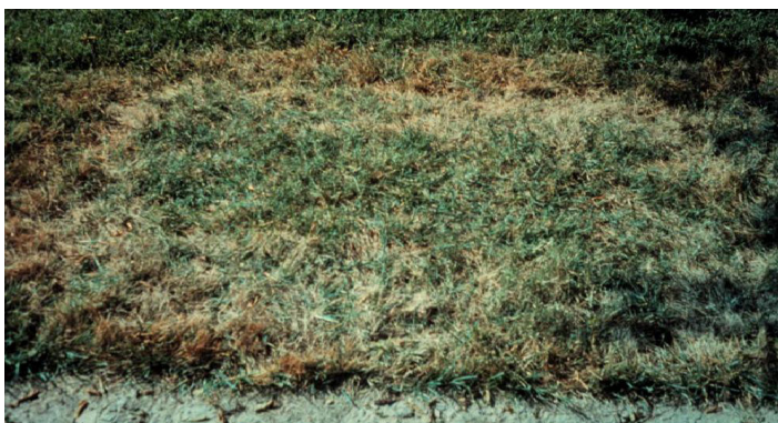
Figure 3. Brown patch symptoms on zoysiagrass. Note that the outer edge is a darker color indicating the fungus is active at this point.