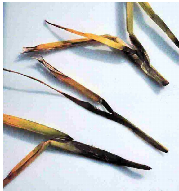
Figure 1. Base of leaf is rotted due to brown patch.

still pull out of the leaf sheath, but the base of the leaf is not dark and rotted (Figure 4). Instead, the leaf base is dry with a tan discoloration and there is no distinct smell of rot.