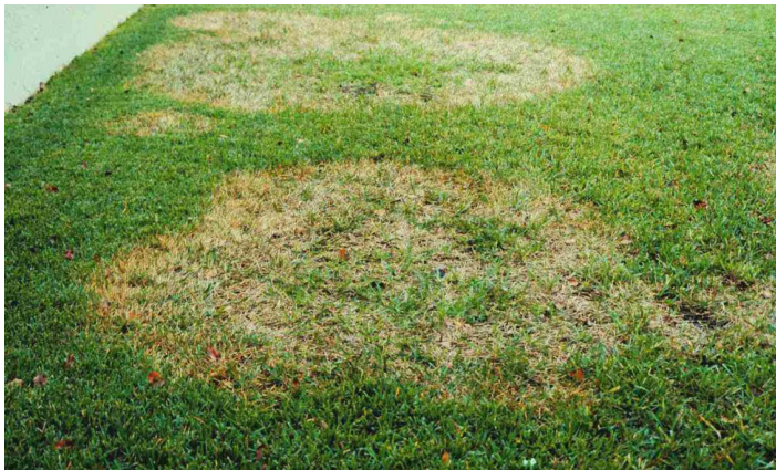
Figure 2. Brown patch symptoms on St. Augustine grass.

equivalent amounts of potassium and nitrogen, preferably a slow-release potassium form, should be applied.