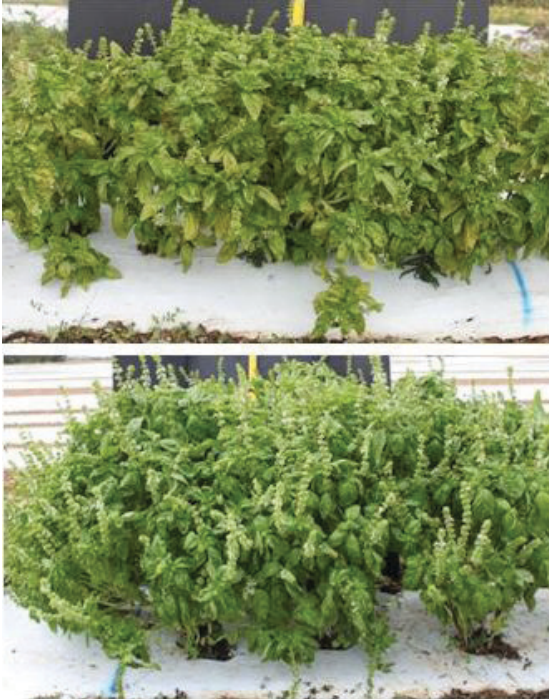
Figure 1. Symptoms of downy mildew on field-grown basil (top) compared with healthy basil plants (bottom).

leaf surface and chlorosis of the adaxial (upper) leaf surface make basil leaves unacceptable for the marketplace.