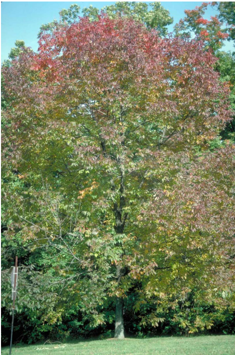
Figure 1. Young Fraxinus americana 'Autumn Purple': 'Autumn Purple' White Ash

'Autumn Purple' White Ash is a male tree introduced in 1956, growing 40 to 50 feet tall and perhaps 35 to 50 feet wide, and is a cultivar of the species which is native to moist locations. The tree grows rapidly and is almost pyramidal with a round top when young, but gradually