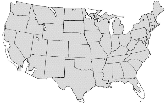
Figure 2. Range

Invasive potential: little invasive potential