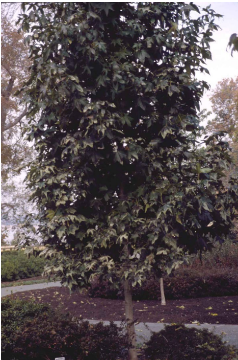
Figure 1. Young Liquidambar styraciflua 'Festival': 'Festival' Sweetgum

corky projections. The trunk is normally straight and does not divide into double or multiple leaders and side branches are small in diameter on young trees, creating a pyramidal form. The bark becomes deeply ridged at about 25-years-old. 'Festival' Sweetgum makes a nice conical park, campus or residential shade tree for large properties when it is young, developing a more upright oval canopy as it grows older.