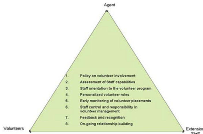
Figure 3. Dynamics of effective volunteer program management. Credits: Terry, B., Godke, R., Heltemes, W., & Wiggins, L. (2010)

An important consideration in working with volunteers is reducing risk primarily to clientele, but also to volunteers, faculty, staff, and UF/IFAS. There are a number of policies, procedures, and regulations that have been established to protect volunteers and the organization.