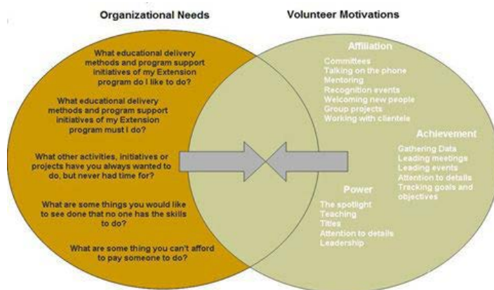
Figure 2. Matching program needs and volunteer roles requires evaluation of potential volunteer interests, skills, and abilities as well as maintenance of a plan for volunteer involvement. Credits: Terry, B., Godke, R., Heltemes, W., & Wiggins, L. (2010)

Another aspect of this illustration is that a volunteer must be capable of performing or learning to perform their assigned role. A key to sustaining a volunteer program is the ability to match the interests, skills, and abilities of a potential volunteer with an appropriate role in the Extension program. This is represented where the two circles overlap.