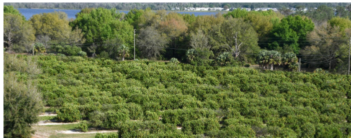
Figure 1. A University of Florida orange grove in Lake Alfred, Florida.

Florida is well known for its citrus industry, which is valued at over 8 billion dollars, and is one of the top citrus-producing states in the United States. Over 90% of Florida's citrus crop is processed (squeezed) for juice. Florida orange juice is shipped around the world. The most common citrus fruit grown in Florida is the Valencia orange, but grapefruit, lemons, limes, and tangerines are also grown in Florida.