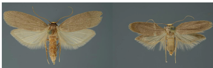
Figure 2. Female (left) and male (right) lesser wax moth adults.