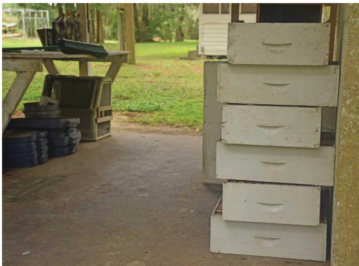
Figure 7. Supers with frames of combs stacked at right angles in a covered, open-walled shed.

Light combs can be protected by increasing the flow of light and air through the supers containing them. This is best done under a covered, open-walled shed located outside. Supers containing combs to be protected this way can be stacked at right angles to one another to increase light and airflow through the stack (Figure 7). Although not applicable to every beekeeper's style, this storage method provides maximum ventilation and lighting and is another alternative to chemical fumigation.