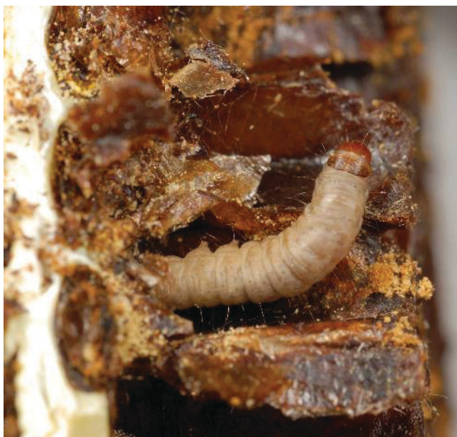
Figure 5. Greater wax moth larva in a wax cell in the brood nest.