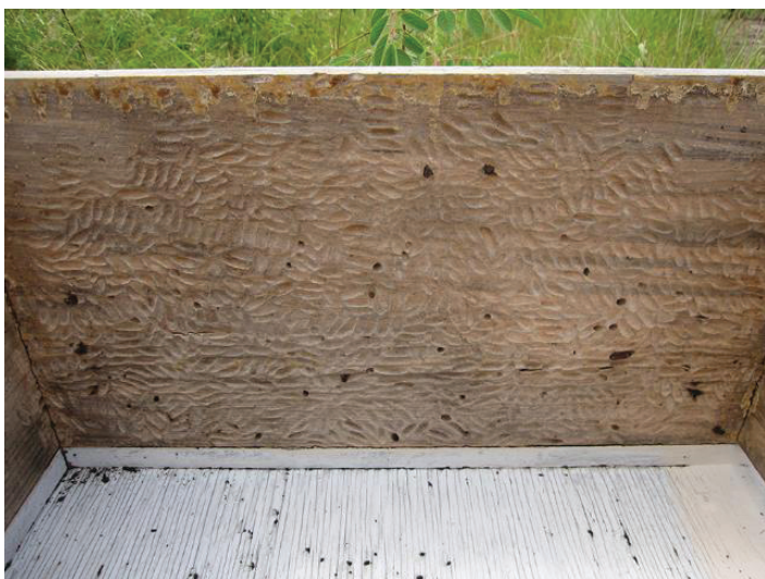
Figure 6. Wax moth damage to the inside wall of the hive.