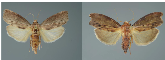
Figure 1. Female (left) and male (right) greater wax moth adults.

The greater wax moth ( Galleria mellonella Linnaeus) (Figure 1) and lesser wax moth ( Achroia grisella Fabricius) (Figure 2) thrive nearly year-round in Florida's mild climate. Both wax moth eggs and their larvae (Figure 3) can almost always be found in bee colonies, but they are no risk to healthy colonies because they are routinely eliminated by worker bees, which keeps their populations in check. Although they do not create problems in healthy bee colonies, wax moths are nevertheless a serious concern for beekeepers. Not only can they become a problem in a weakened bee colony, they also ruin stored honey bee combs and cause costly damage to beekeeping equipment.