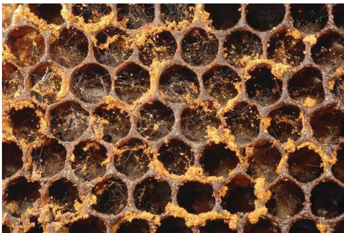
Figure 4. Greater wax moth damage (frass and webbing) to wax comb.