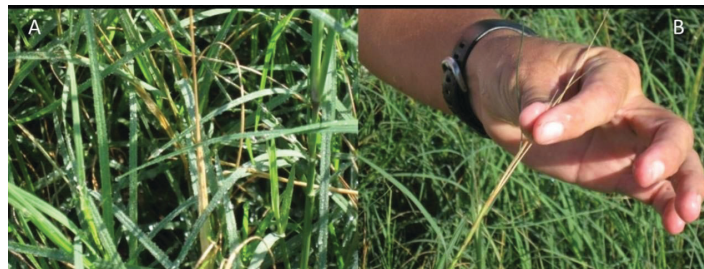
Figure 5. (A–B) Bermudagrass stem maggot damage.

Fall armyworm is very common mid- to late-summer into the fall and is considered a problem if there are 3 or more worms per square foot of pasture. When scouting, avoid the margins of the field and sample in early mornings or late afternoons when larvae are more active. Grazing or mowing can suppress infestations, but if an infestation occurs in the early stages of pasture or hay regrowth, an insecticide (e.g., carbaryl, malathion, cyhalothrin) can be used. Follow label instructions for rates and observe withdrawal periods, which vary depending on the product and use (hay or grazing). More information on fall armyworm can be found in EDIS publication ENY-098, Fall Armyworm , Spodoptera frugiperda ( https://edis.ifas.ufl.edu/in255 ).