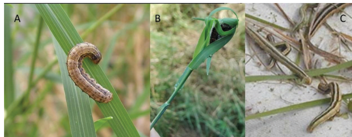
Figure 6. (A) Fall armyworm. (B–C) Striped grass loopers in bermudagrass.

Spittlebug ( Prosapia bicincta ) is another insect that can damage bermudagrass in wet weather. The presence of the insect is indicated by a white froth or spittle-like material at the base of the plant, which contains the young insect. Adults emerge from the froth as dark brown or black flying insects that are about 3/8 inch long with two orange-red lines across the wings. Spittlebugs appear in June and late August. When feeding, the adults and immature insects inject a toxin into the plant that causes the leaves to turn brown and look frosted. The affected areas enlarge as the adults spread and feed. Mowing or grazing to keep the grass from growing tall, lodging, and becoming densely matted will prevent most spittlebug problems. Burning of the bermudagrass in February or just prior to green-up will help to control spittlebug by killing the overwintering eggs and early immature stages of the insect. There is a small risk involved when this practice is used on a less cold-tolerant