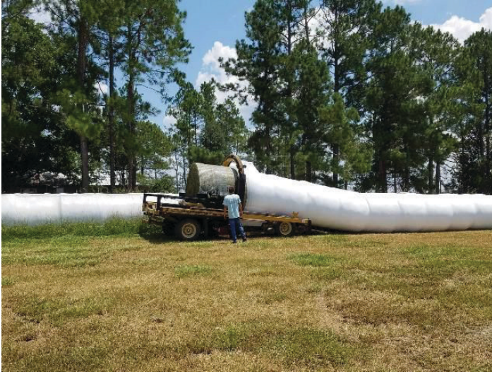
Figure 3. Bermudagrass round bale wrapped in plastic.

edis.ifas.ufl.edu/ag181 ), and EDIS document AN266, Comparison of Hay or Round Bale Silage as a Means to Conserve Forage ( https://edis.ifas.ufl.edu/an266 ).