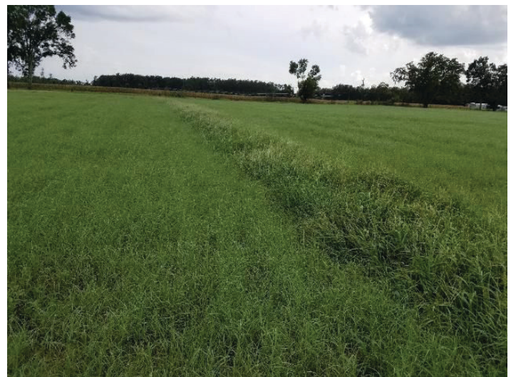
Figure 4. "Skip" strip when spraying imazapic for crabgrass control in T85 bermudagrass field.