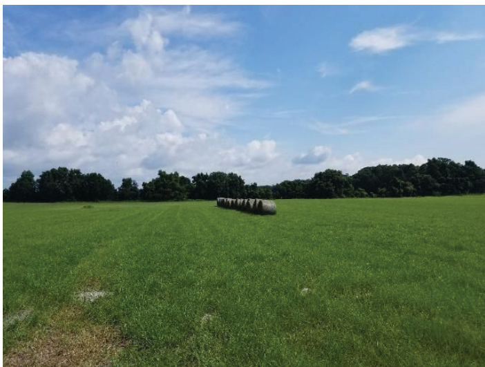
Figure 1. Tifton 85 bermudagrass hayfield in Florida.

Common bermudagrass was first introduced to the US over 150 years ago from Africa. It has very aggressive growth characteristics and is often a major weed in cultivated crops of the Southeast due to viable seed production. It has relatively low nutritive value and productivity, forms a dense sod, and barely grows over 3 to 4 in tall. It is a very common weed in many pastures that is hard to eradicate selectively. However, it is still used as a pasture crop, especially in soils with low fertility and management levels.